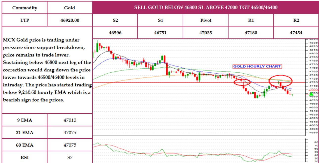
Chart of the days